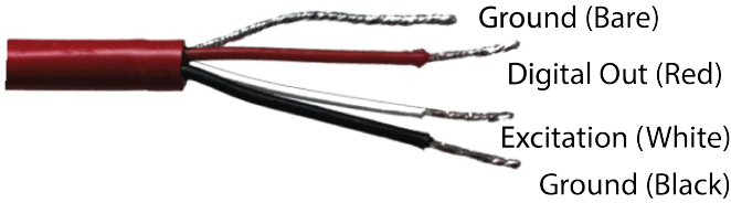
Figure 2: Pigtail End Wiring

Connect the wires to the data logger as Figure 3 shows, with the supply wire (white) connected to the excitation, the digital out wire (red) to a digital input, the bare ground wire to ground. (Figure 2)